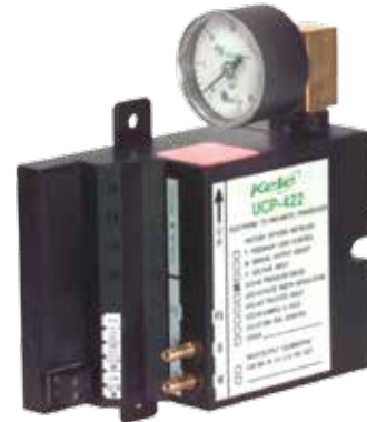
UCP-422-43 (Shown with Optional Pressure Gauge)